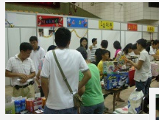
Participants visited the Sunday Market after the sharing session.

Through the Sunday Markets and the Inspirational Programme for the local business operators, residents could come to know the distinctive features of the shops in the district. By providing a platform for the residents and business operators, the Sunday Markets could also encourage residents to spend at individually owned shops in the district. To make preparations for the Sunday Markets, the youth volunteers spent four months on visiting the small business operators in the district so as to build up a relationship of trust with them. With the help of the youth volunteers, over 40 business operators were invited to participate in the Sunday Markets.