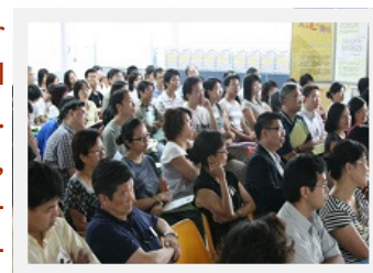
The audience paid full attention in listening to the speaker.